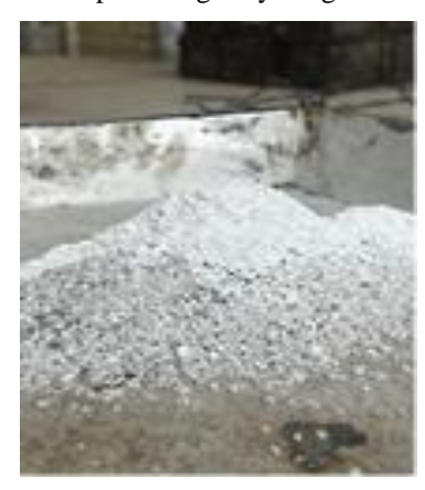
Figure 1: Waste Marble Powder (WMP)

concrete while minimizing the consumption quantity of cement and natural (fine and coarse) aggregates. The fundamental objective of this research endeavor is to manufacture innovative, sustainable and eco-friendly concrete by partially replacing sand with waste marble powder at different percentages by weight of sand.