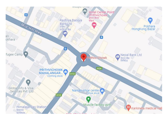
Figure 2: Prithivi Chowk Intersection

The north, south and west legs are of four lanes and east leg is of six lane The location of the study intersection is shown in figure 2.