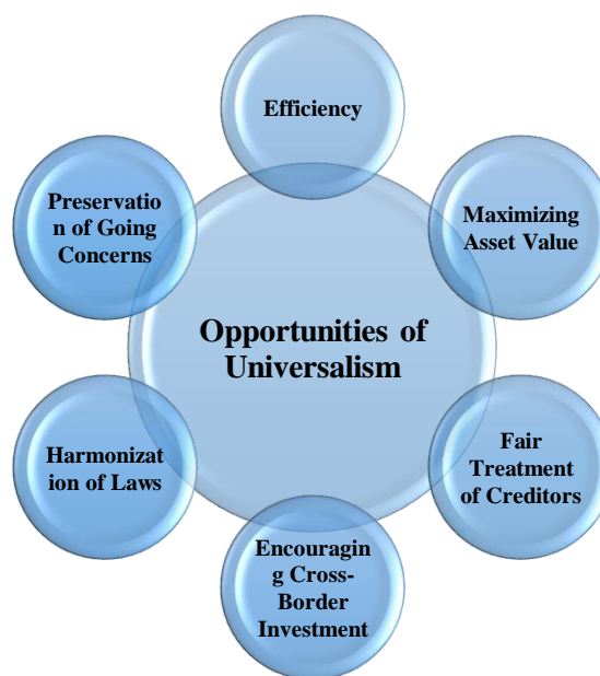
Figure 3: Opportunities of Universalism