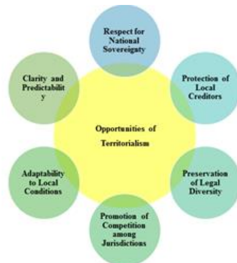
Figure 5: Opportunities of Territorialism