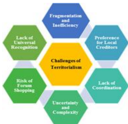
Figure 6: Challenges of Territorialism