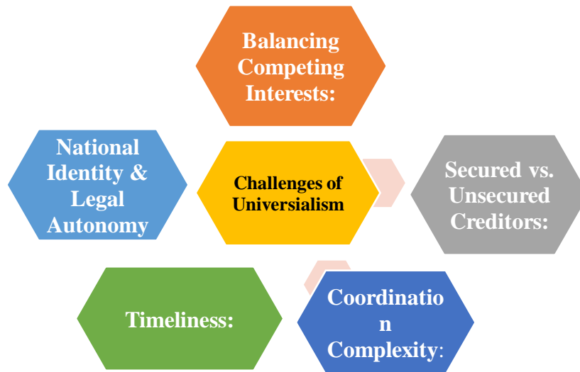
Figure 4: Challenges of Achieving True Universalism